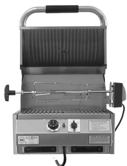
16" MODEL IS 4400-EC-224-I-16