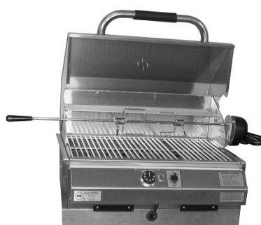
24" MODEL IS 4400-EC-336-I-24

Required Outlet: Nema 6-20R Receptacle 208/220 Volt 20 Amp receptacle 50/60 Hz