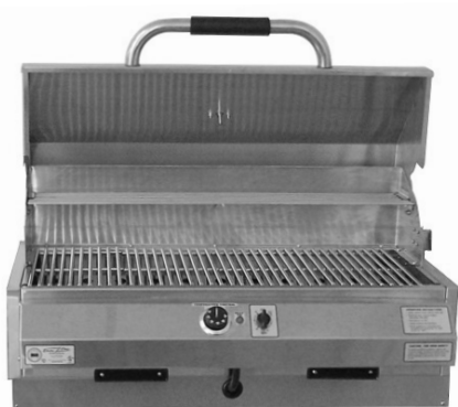
32" MODEL IS 4400-EC-448-I-S-32 (SINGLE CONTROL)

Required Outlet: NEMA 6-50R Receptacle 208/220 Volt 50 Amp receptacle 50/60 Hz (use with 40 Amp breaker)