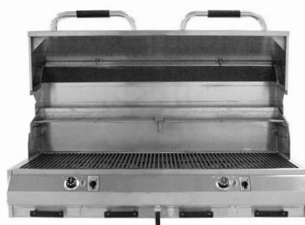
48" MODEL IS 8800-EC-1056-I-D-48

Required Outlet: Nema 6-20R Receptacle 208/220 Volt 20 Amp receptacle 50/60 Hz