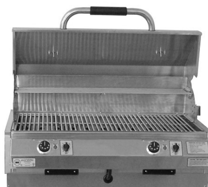
32" MODEL IS 4400-EC-448-I-D-32 (DUAL CONTROL)

Required Outlet: NEMA 6-30R Receptacle 208/220 Volt 30 Amp receptacle 50/60 Hz